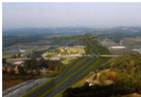
Artist rendering of the Knoxville Parkway at Hardin Valley Road.

Knoxville (WVLT) - TDOT hopes it has the solution to the traffic nightmares in West Knoxville and West Knox County.